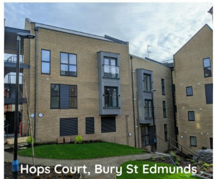
Hops Court, Bury St Edmunds