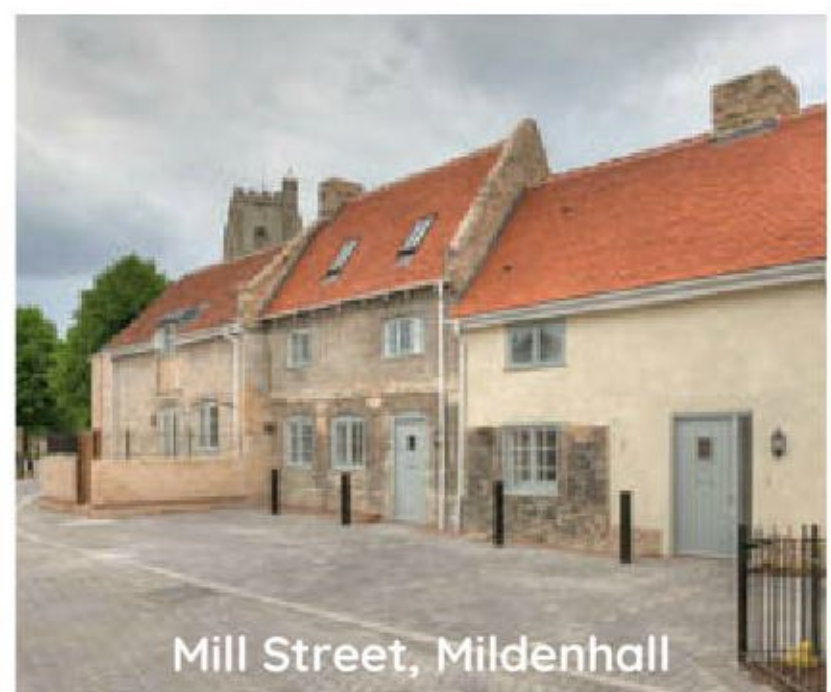
Mill Street, Mildenhall